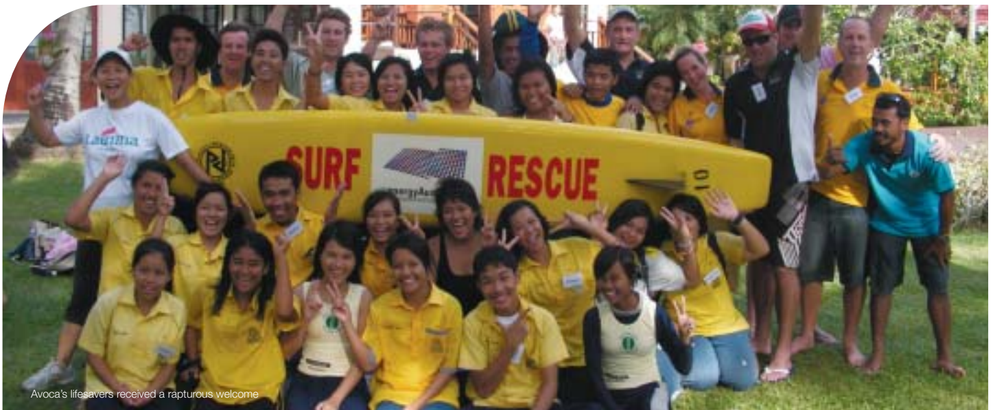
Avoca's lifesavers received a rapturous welcome