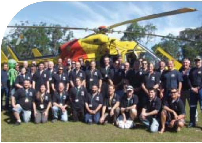
Support Operations personnel with the Westpac Life Saver Helicopter