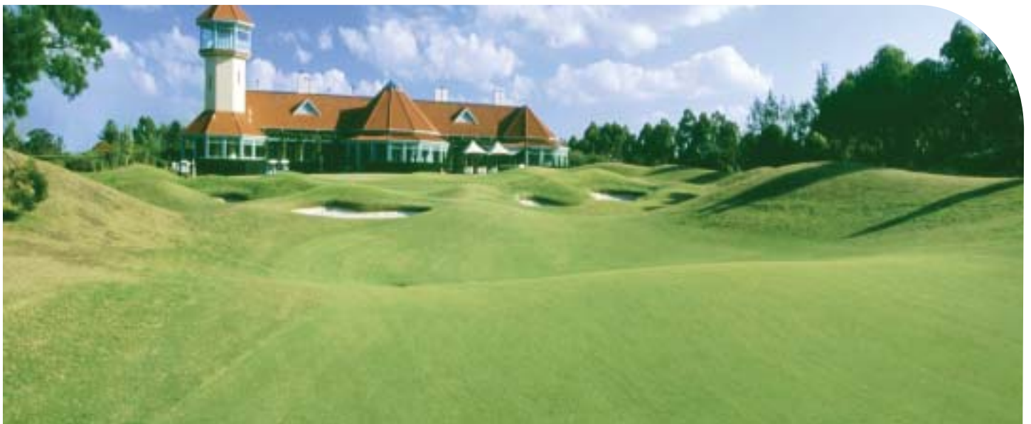
The picturesque 18th hole at Terrey Hills Golf & Country Club