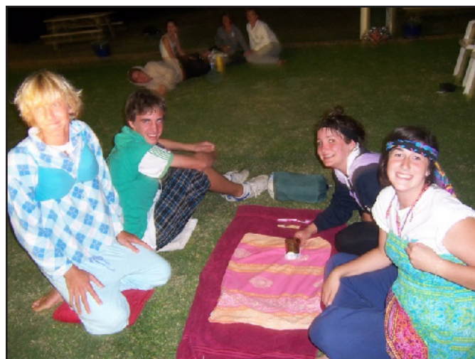
Killy Cadets at Crowdy